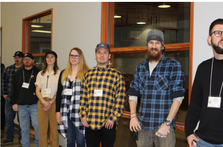
New journey-level carpenters waiting in line for their certificates.