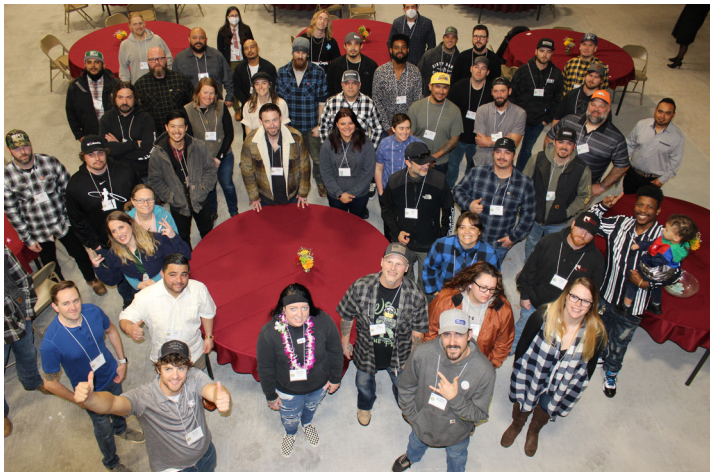
Group Photo of our new Journey-level Carpenters