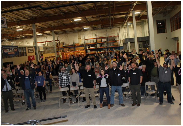
PNCI's new journey-level carpenters and families celebrate the big day.